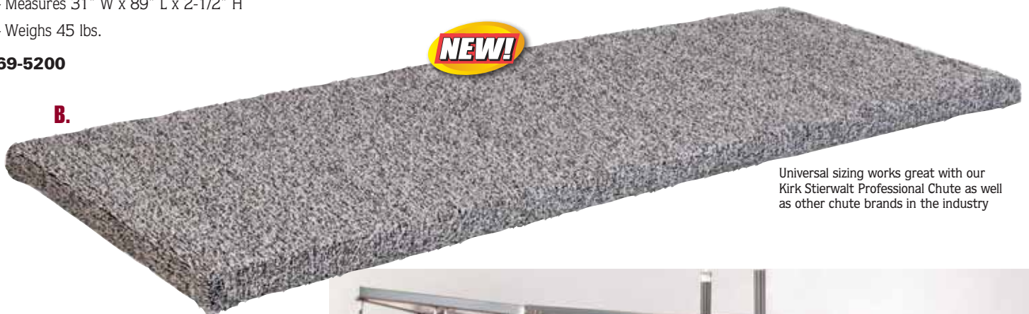
Universal sizing works great with our Kirk Stierwalt Professional Chute as well as other chute brands in the industry