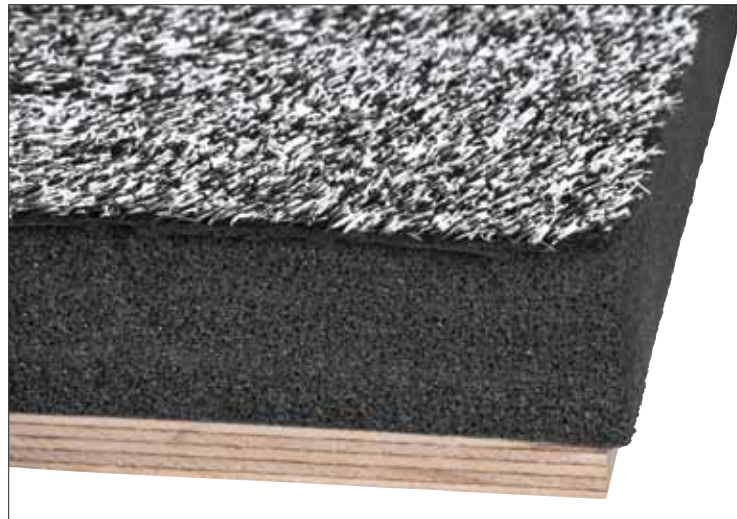
Sealed exterior grade lumber, thick closed cell foam and rugged outdoor carpet make up the high quality, durable construction of this chute floor