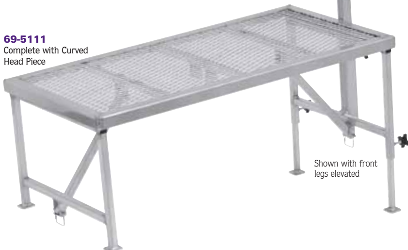
Shown with front legs elevated