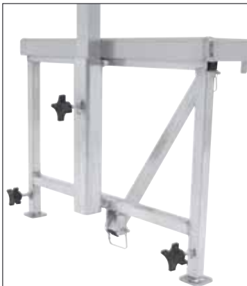
Adjust head piece and front legs with easy-to-turn knobs