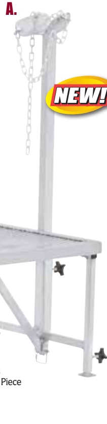
69-5110 Complete with Straight Head Piece